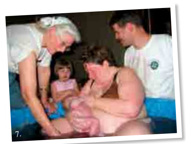
Support during this mother's water-birth makes immediate initiation of breastfeeding easier.

In the first hour of life, a baby finds her mother's breast. Together they can do it on their own, when we respect maternal/infant physiology as we provide expert maternal child care. This is the beginning of a lifesustaining breastfeeding relationship between mother and child.